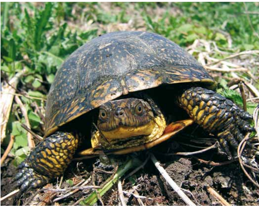
Fig. 1 Blanding's turtles ( Emydoidea blandingii ) have been comparably well studied and the use of the earth geomagnetic field for orientation has been shown.

types of GMF that are probably used according to their specific habitats have been recognized (KRAMER 1950): First, the use of the earth GMF to establish a geomagnetic field map for orientation and navigation, and second the use of the GMF in combination with a solar (or sun-) compass, mainly using UV-radiation for orientation (LOHMANN et al. 2007, 2008, CONGDON et al. 2015, PUTMAN et al. 2015). In addition a third type of GMF, which may be considered as a sub-type of the formerly described types, has been described for young snapping turtles ( Chelydra serpentina ) by LAND-