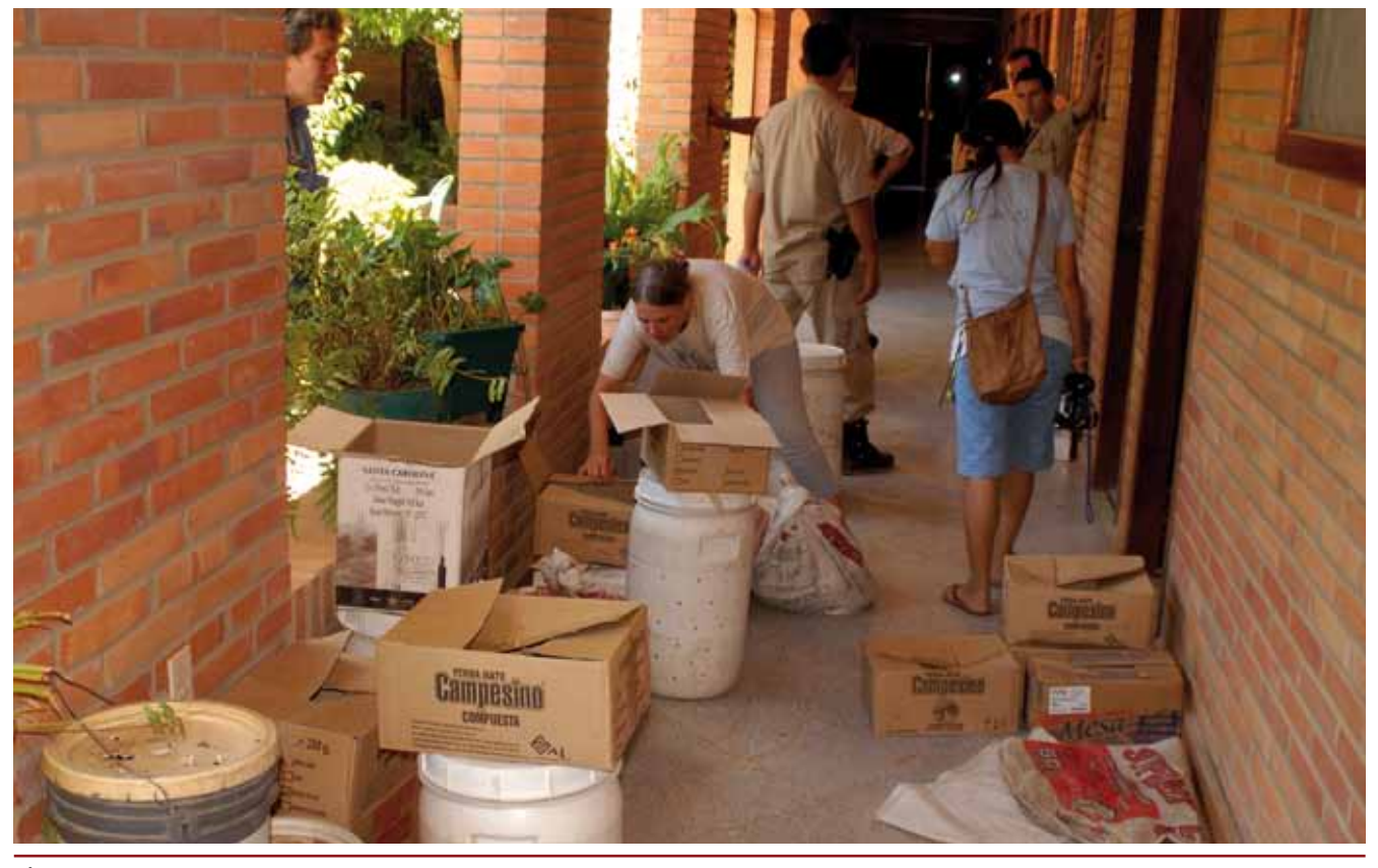
Fig. 4 A chaotic pile of buckets, paperboards and bags was found in the hotel.

of buckets were piled up, bags and boxes full of wild animals were in a rather poor state. Aside from armadillos, which were piled up on top of each other in a big container and which were heavily traumatized and injured. We also found a wide range of different and mostly dehydrated amphibians, some of which were dead and squeezed into a 20 litre bucket there also was a collared anteater. Shortly after, we were called to another hotel, where again the room was rented there in order to accommodate animals. The picture was similar. On the floor there were dying armadillos, in 20 litre containers, bags, boxes and buckets some more armadillos, amphibians, reptiles and tarantulas were stored. Additionally a car was confiscated containing an estimated 200 snakes and lizards contained in plastic bottles (we did not have